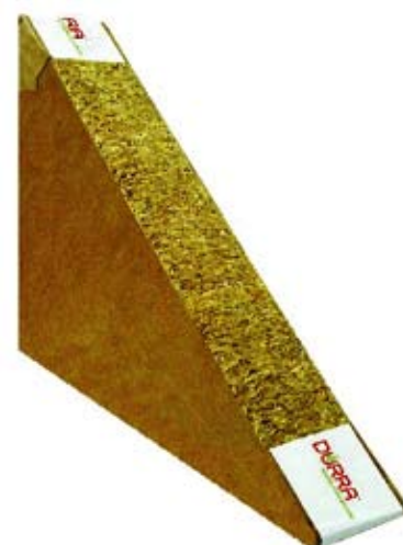
DURRA PANEL CROSS SECTION

The Durra Panel production process is environmentally sound, densely compressing a largely wasted resource - wheat or rice straw fibre - into construction panels. No chemical binding agents are used in this unique manufacturing process which leaves zero toxic waste.