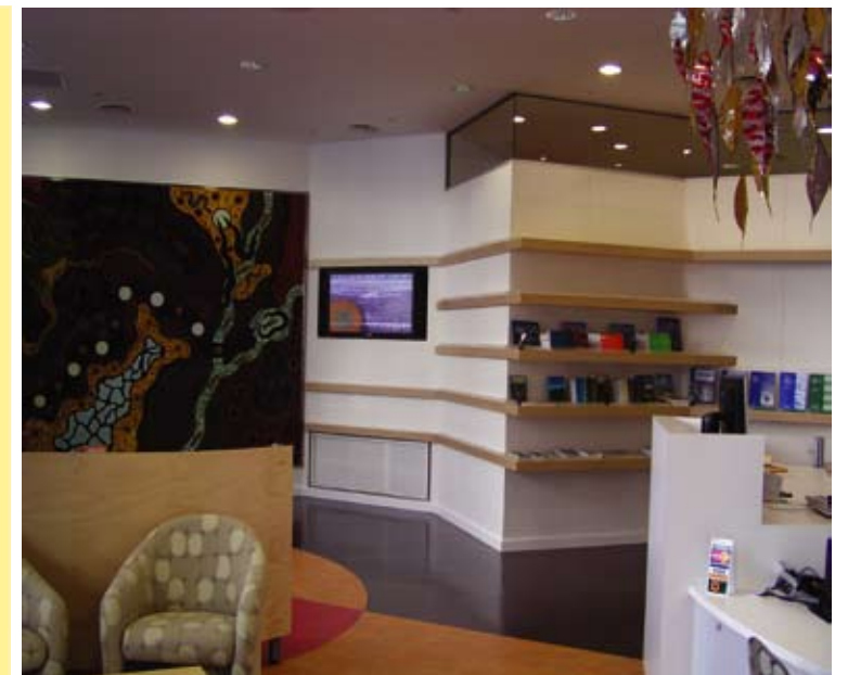
ENVIRONMENTAL PROTECTION AGENCY (EPA)

After completion of the Durra Wall, architraves and skirting boards can be fixed into place.