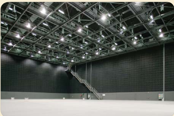
CENTRAL CITY STUDIOS - DOCKLANDS