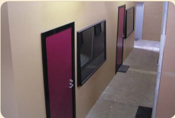
DOLBY 5.1 STUDIOS

The face of Durra Panel is a Kraft paper liner which can be painted for a complete interior finish. Optional Acoustic Pattern finish is available for internal reverberation control.